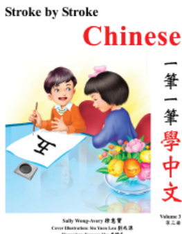
Stroke by Stroke Volume 3 一筆一筆學中文第三冊

聖地牙哥中文學校即將完成“好禮貌圖版”及“一筆一筆學中文第三冊”。這兩本書的作者為聖地牙哥華人服務中心董事長徐惠寶女士。“好禮貌圖版”利用圖來教導小孩與大人一些中華文化中的基本禮儀與道德。“一筆一筆學中文第三冊”收集了一些五個筆劃的中文字。