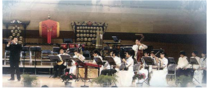
Image China Music Performance 中華風韻古典音樂會

聖地牙哥華人服務中心很榮幸的贊助中華風韻美國之旅的表演活動。中華風韻古典音樂會將在十二月十二日晚六點中在La Jolla的Sherwood音樂廳隆重表演。地址為700 Prospect Street, La Jolla, CA 92037。票價分為:$100、$50、$30元。購票與資訊專線為(619)549-1159或(619)549-0927