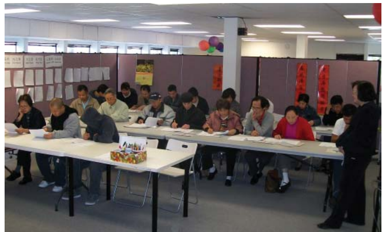
Food and Health Sanitation Class 食物安全衛生班