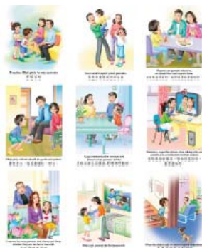
Good Manner Picture book 好禮貌圖版